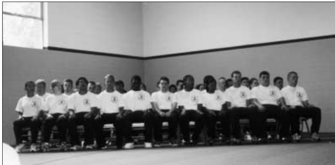
Class picture, graduation day at the Academy.

"The cadets were real receptive. They listened very well. Once in a while you'd have somebody try to challenge you, but in the end, it was an absolute nice turnout."