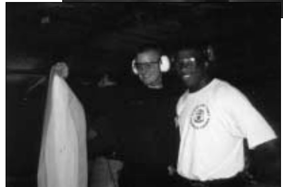
A cadet tries his hand at firearms training.

especially being able to coordinate everything with a bunch of kids whose hormones are jumping up and down!”