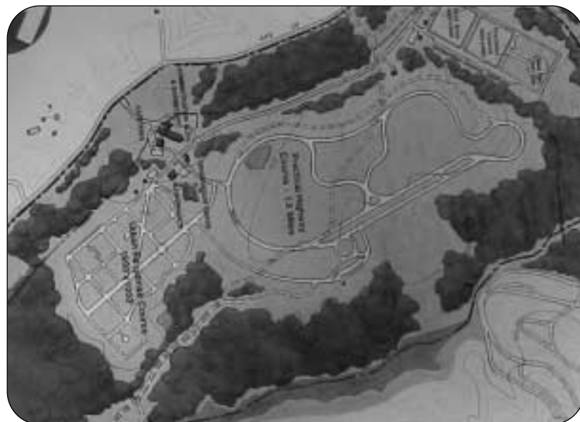
Close Up of Course Sketch.

Proponents say the track, a project which has been discussed since the mid-1980s, is long overdue. Law enforcement officers train repeatedly with their firearms, yet an officer is far less likely to use his weapon over the course of his career than he is to get injured