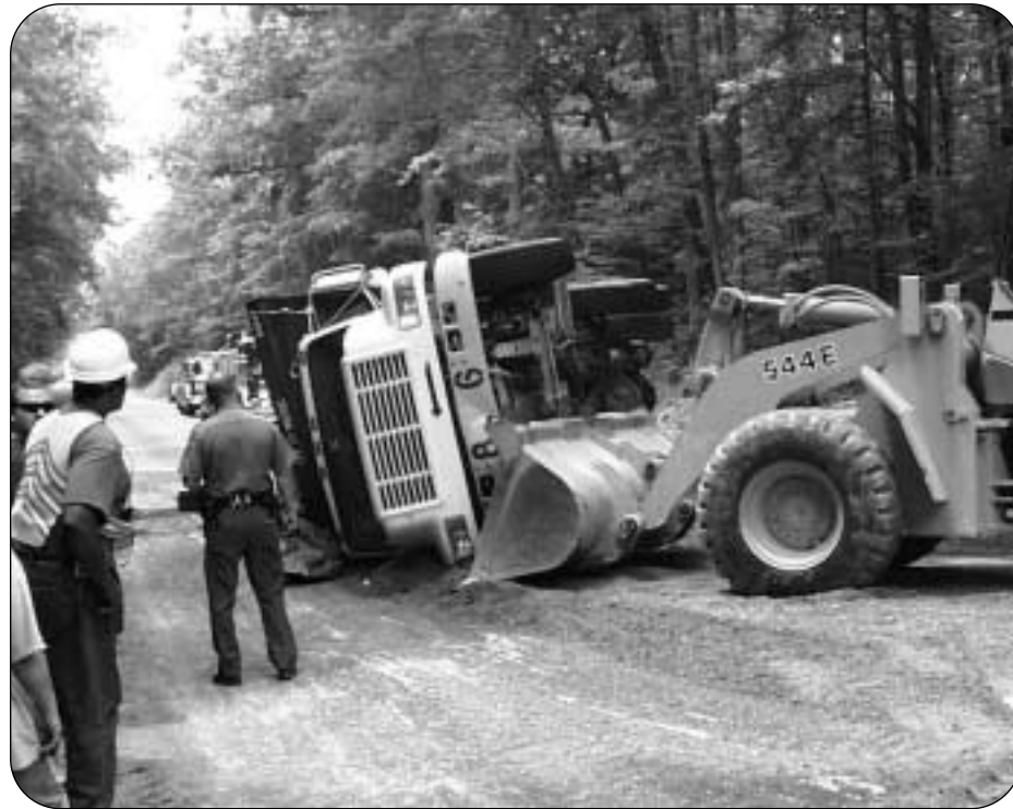
A dump truck hauling shoulder stone overturned June 18 near Lancaster Court House on Route 3. Trooper Chuck Davis responded to the accident, which forced the road to close for over an hour. No serious injuries were reported.